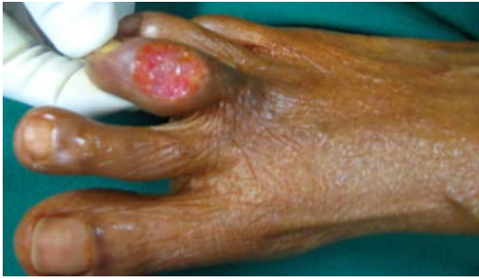
Fig 1: Chronic non healing ulcer dorsum of third toe – right foot

were administered based on culture and sensitivity reports by her family physician. There was no history of fever but she had loss of appetite and loss of about 3 kgs of weight in a period of six months. Physical examination revealed an ulcer of 1cm diameter overlying the dorsum of third toe of her right foot. (Fig 1) Interphalangeal joint movements were restricted and painful. There was surrounding oedema. Dorsalis pedis and posterior tibial artery pulsations were well felt bilaterally. There was no regional lymphadenopathy. The chest and abdomen were clinically normal. Plain radiograph of right foot which was done one month after trauma was found to be normal. Six months later it revealed cortical erosion of middle phalanx of third toe with osteoporosis of distal and proximal phalanges. (Fig 2) A diagnosis of post traumatic non healing ulcer due to chronic osteomyelitis was