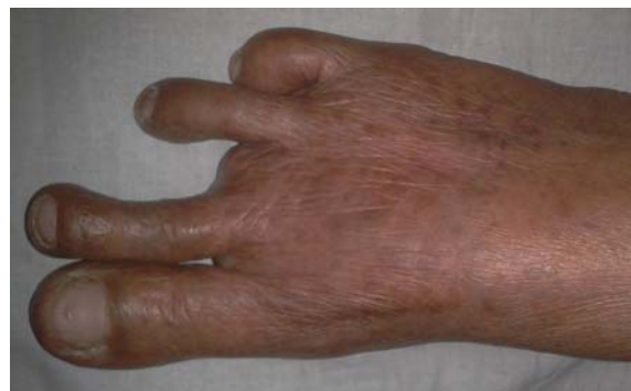
Fig 4: 5 years later – well settled scar

The involved toe was disarticulated at the metatarsophalangeal joint and closed with Fillet flaps. The specimen of bone and soft tissue was found to be infiltrated with granulomas composed of epithelioid cells, multinucleated giant cells and lymphocytes without caseous foci on histopathological examination which suggested tuberculous osteomyelitis. (Fig3) Bacteriological examination did not reveal any growth on culture and subsequent ZN stain was negative for AFB. The wound healed in a weeks' time. (Fig 4) Patient was treated with four drugs Rifampicin, Isoniazid, Ethambutol